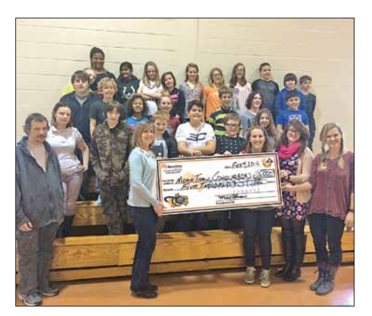
MORE THAN CONQUERORS

Applications can be downloaded from our website at www. ninestarconnect.com.